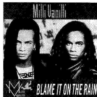
3. Milli Vanilli 502